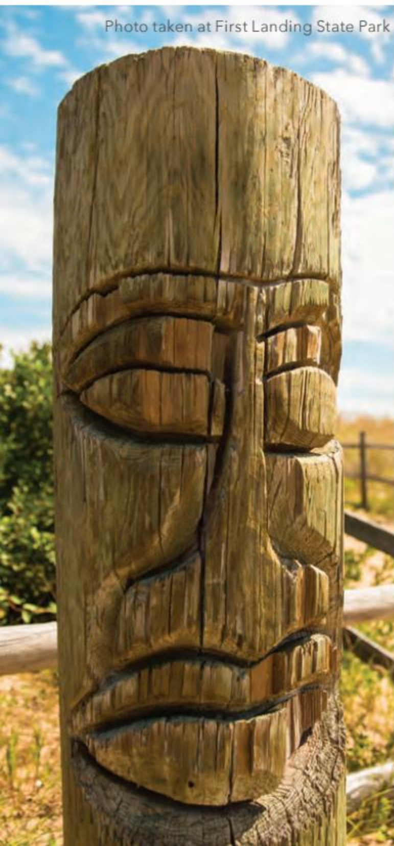
Photo taken at First Landing State Park