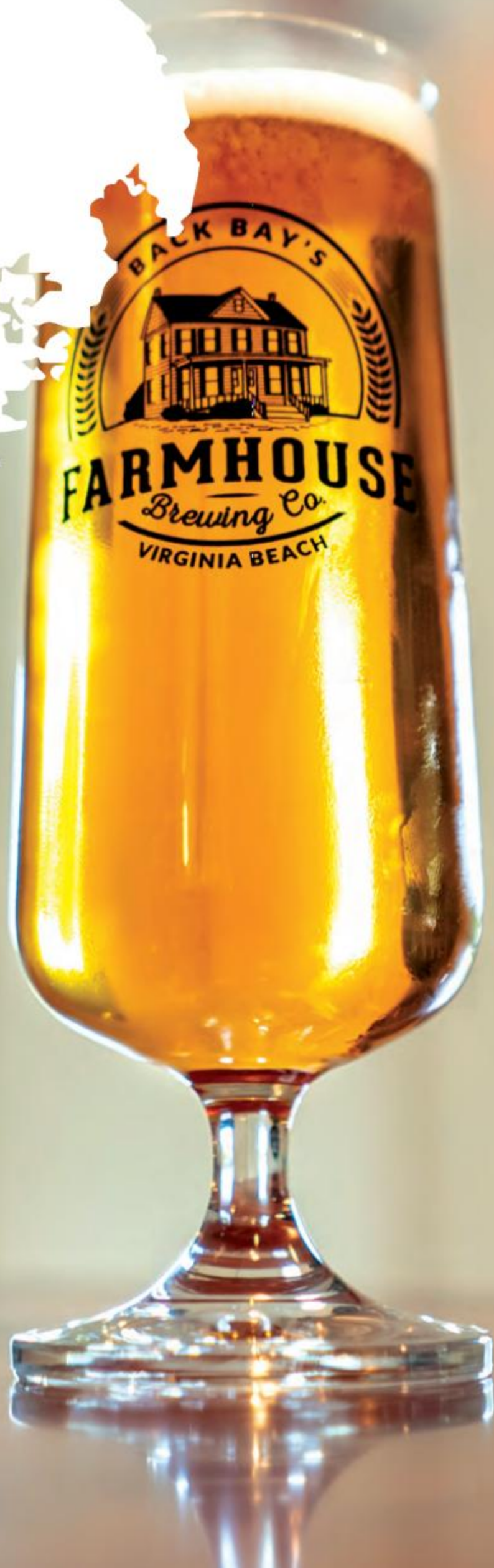
Photo taken at Back Bay's Farmhouse

The ever-expanding craft beer scene in Virginia Beach is overflowing with unique flavors. From juicy IPAs bursting with hops to complex barrel-aged sours, there's a beer, and a brewery, for everyone. The Virginia Beach Beer Trail is about celebrating all of our great local breweries and brews, from the Chesapeake Bay District to the Oceanfront, one pint at a time. Cheers!