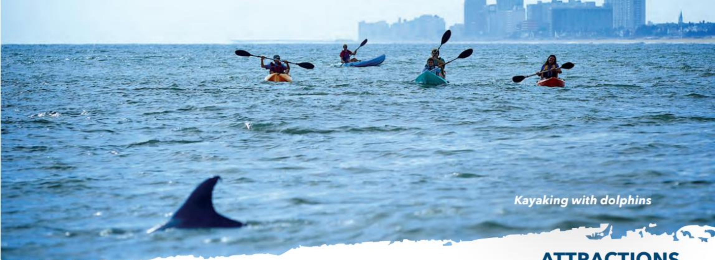
Kayaking with dolphins