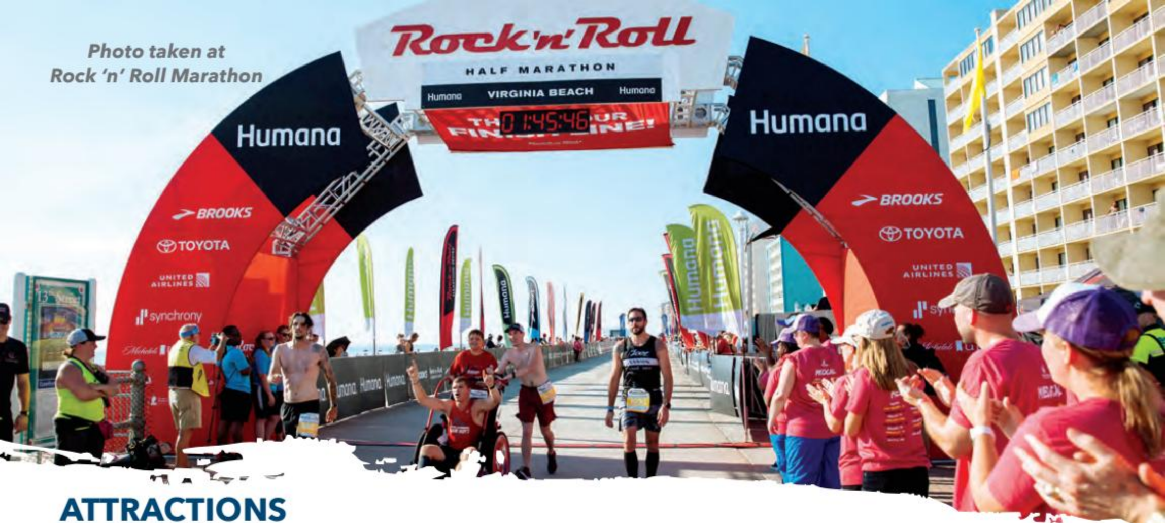
Photo taken at Rock 'n' Roll Marathon