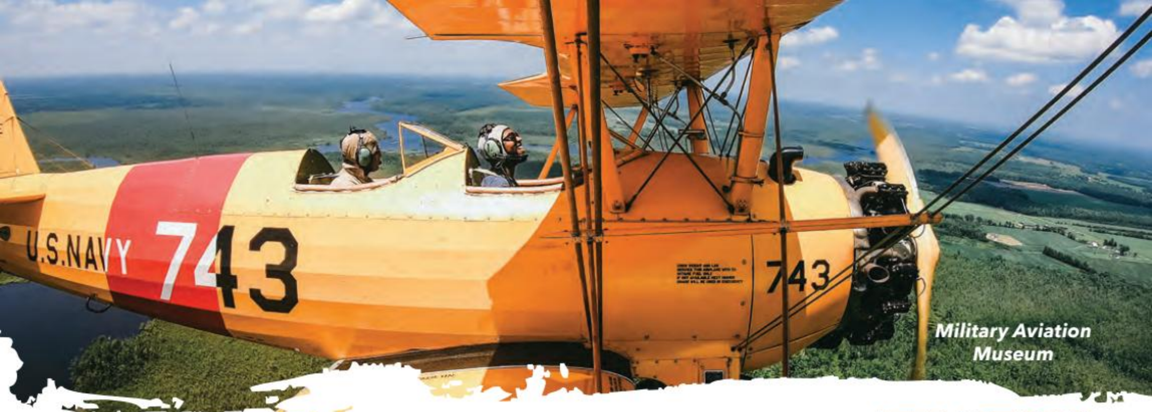
Military Aviation Museum