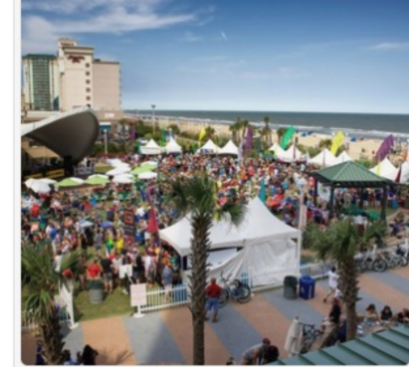
31st Street Stage and Park (King Neptune's Park) in Virginia Beach

The King Neptune Statue overlooks the yard and stage area. This is a large stage with a large lawn in front of it. Larger bands and festivals are commonly held here and there is a municipal parking garage right across the street between 30th and 31st Street.