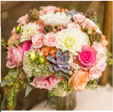
For more about planning a beach wedding, go to VisitVirginiaBeach.com/ wedding-planning.