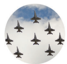
STRIKE FIGHTER SQUADRON FLYING IN FORMATION